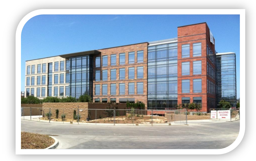
Figure 1: Exterior View of Research Facility Core and Shell

The building is four stories above grade with an underground parking garage. The gross square footage of the building is 130,000 SF and will operate as a mixed use facility comprised of both laboratory and office space.